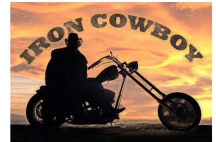
Saturday October 14 th 5-9PM