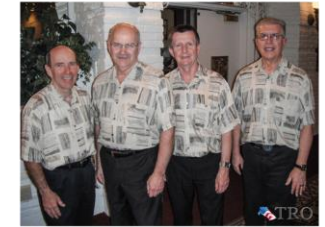
THE SHORELINERS Friday October 13 th 3-7PM