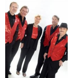
MEMORY LANE Sunday October 15 th 2-6PM